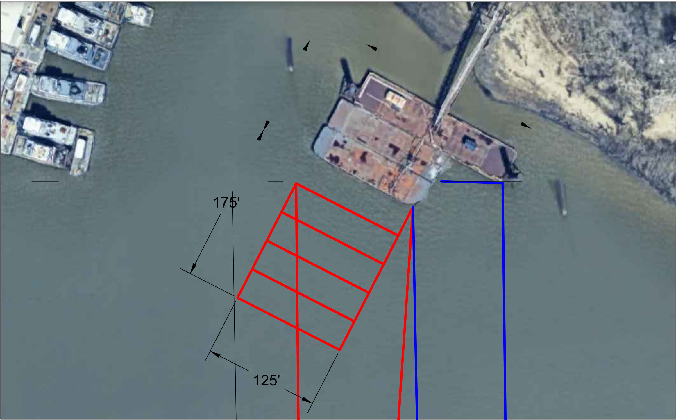
BARGE OVERHEAD VIEW